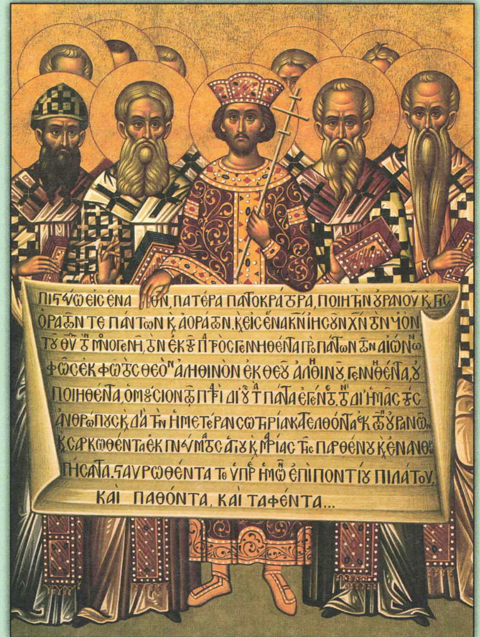
Icon of the Fathers of the First Ecumenical Council of Nicea