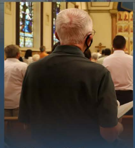
Music & Prayer