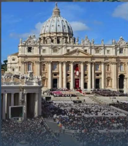
Unity & Heritage

Whether new to the East or looking to deepen your understanding, this event offers prayer, music, conversation, and rich tradition and culminates in sung Divine Liturgy