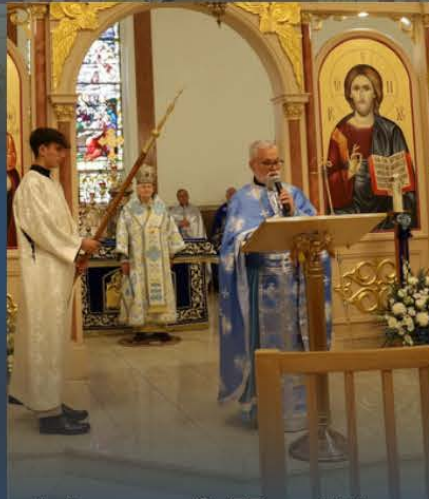
Liturgy & Tradition