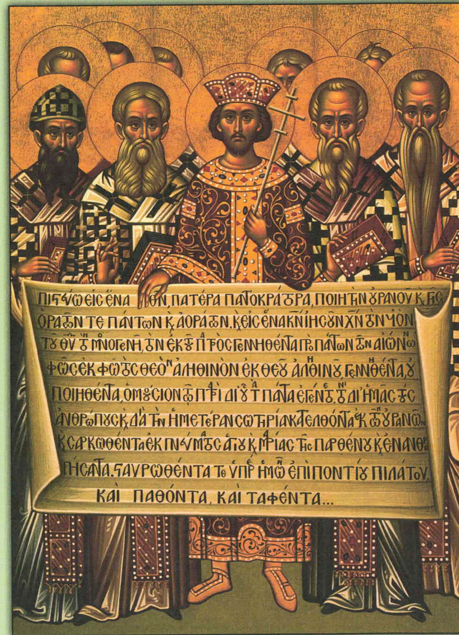
Icon of the Fathers of the First Ecumenical Council of Nicaea