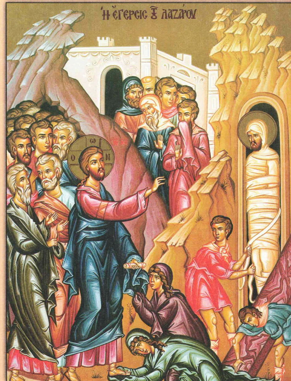
Icon of Raising Lazarus from the Dead