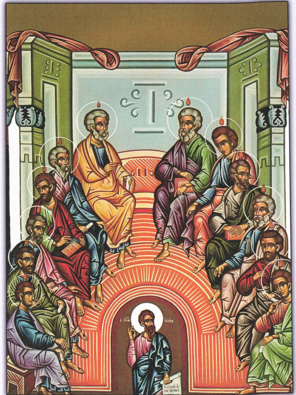
Icon of Pentecost