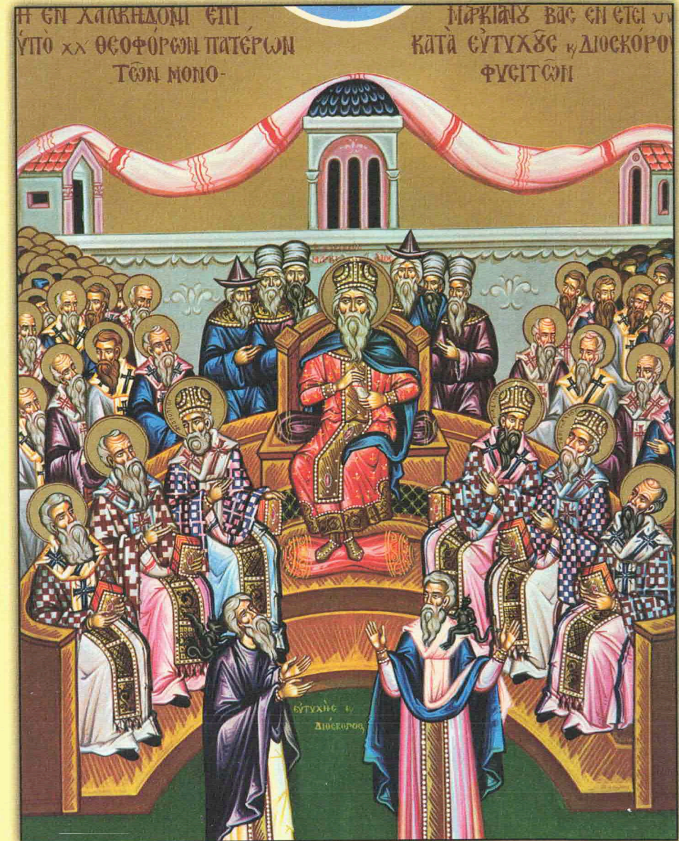
Icon of the Holy Fathers