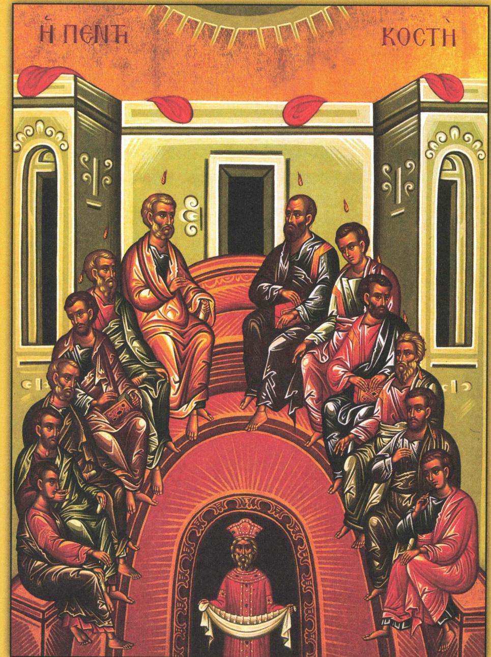
Icon of Pentecost