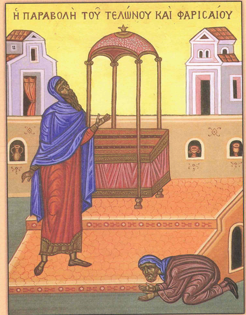
Icon of the Publican and Pharisee (Luke 18:10-14)