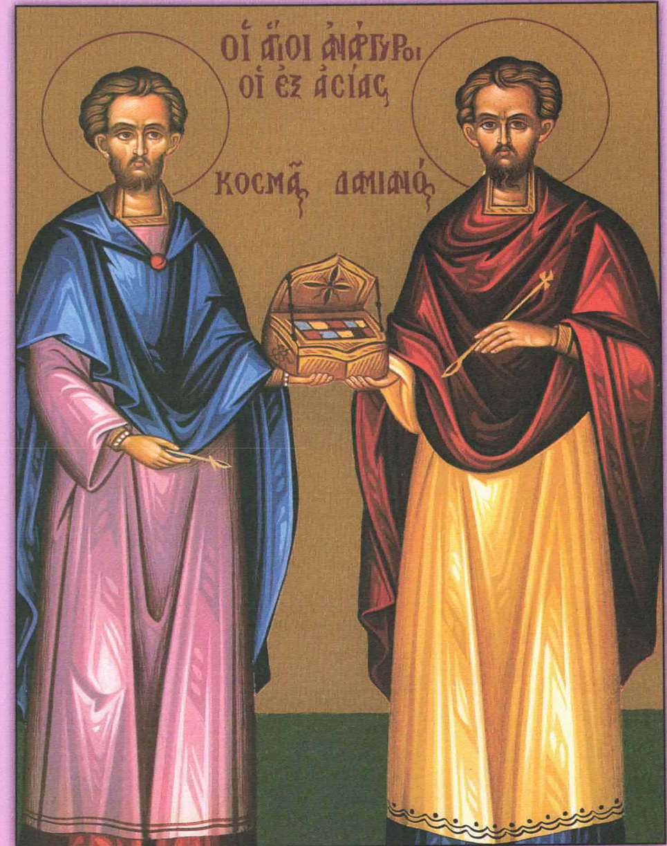
Icon of Saints Cosmas and Damian -- November 1st