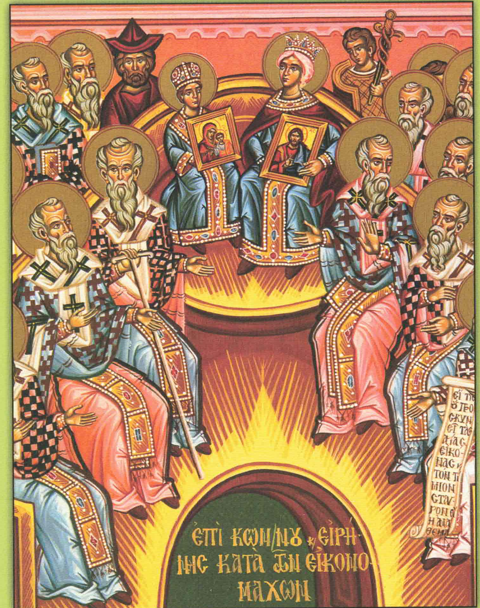
Icon of the Fathers of the Seventh Ecumenical Council