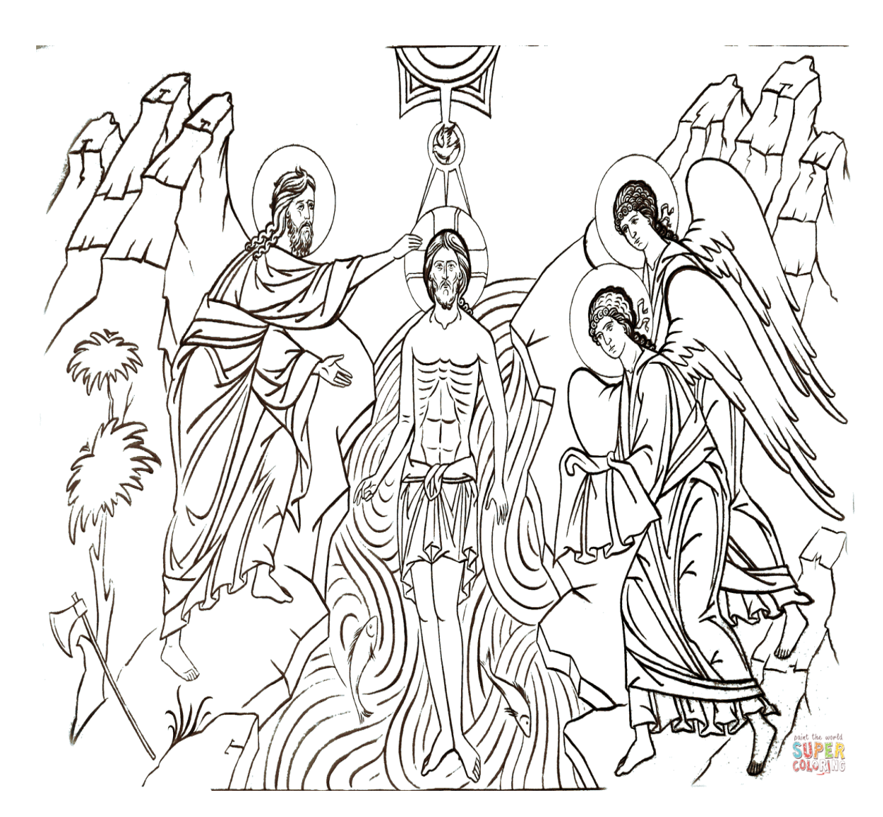
EASTERN CHRISTIAN FORMATION (ECF) PROGRAM FOR CHILDREN: Please visit <a href="https://www.godwithusonlineorg">www.godwithusonlineorg</a>, and be sure to click on "Ruthenian," for this week's catechetical resources, including the Gospel summary and discussion questions, that you can use in your catechesis.