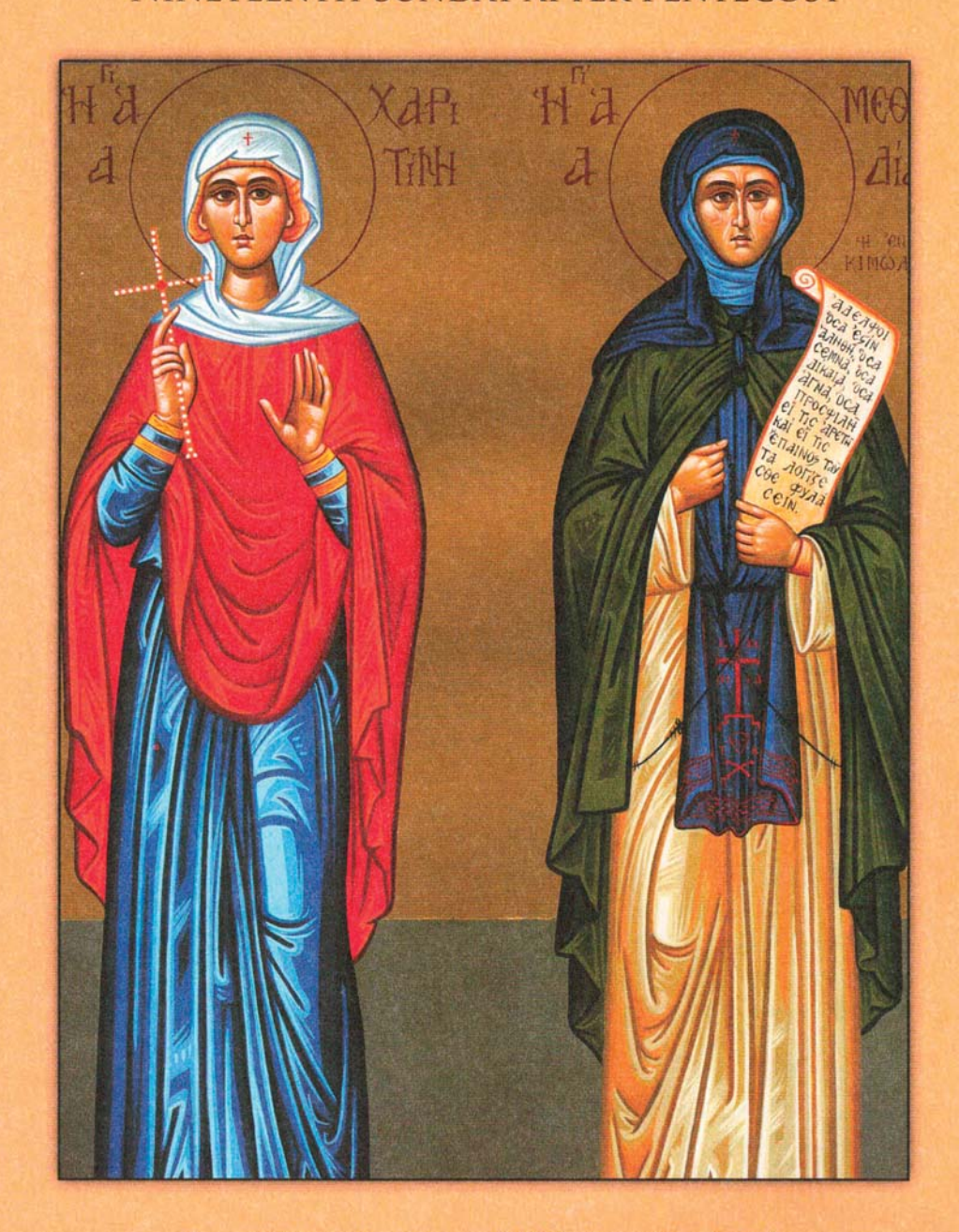
Icon of Saints Charitina and Methodia -- October 5th