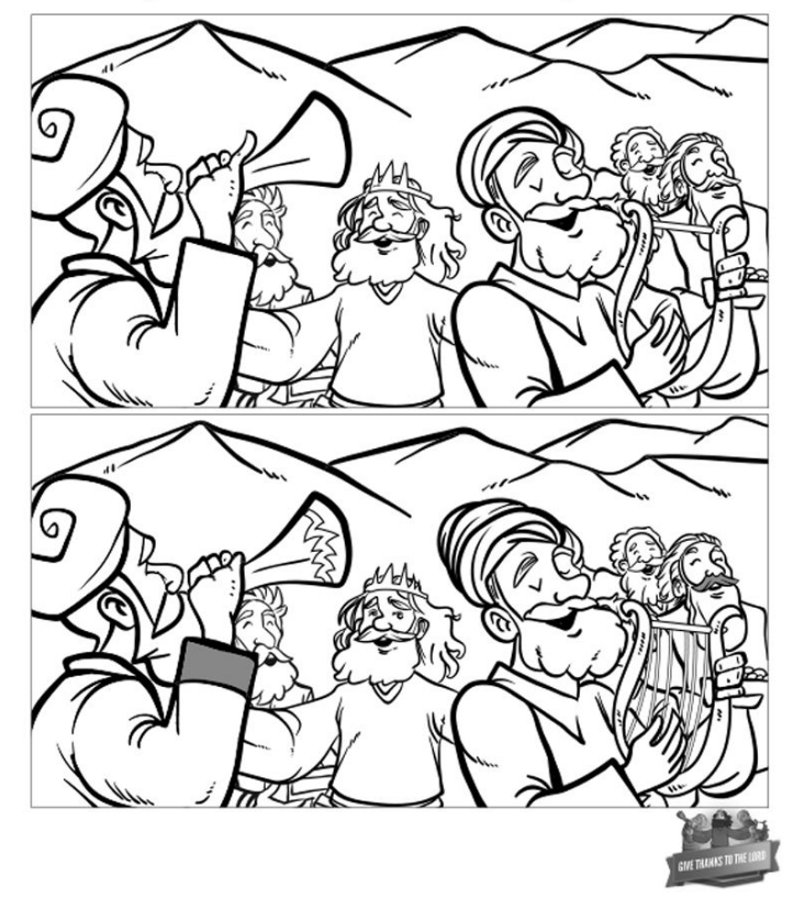
D SharefaithKids. All Rights Reserved. Reproduction or Reselling forbidden. Not for use without an active SharefaithKids subscriptio

Spot 8 differences between the two pictures.