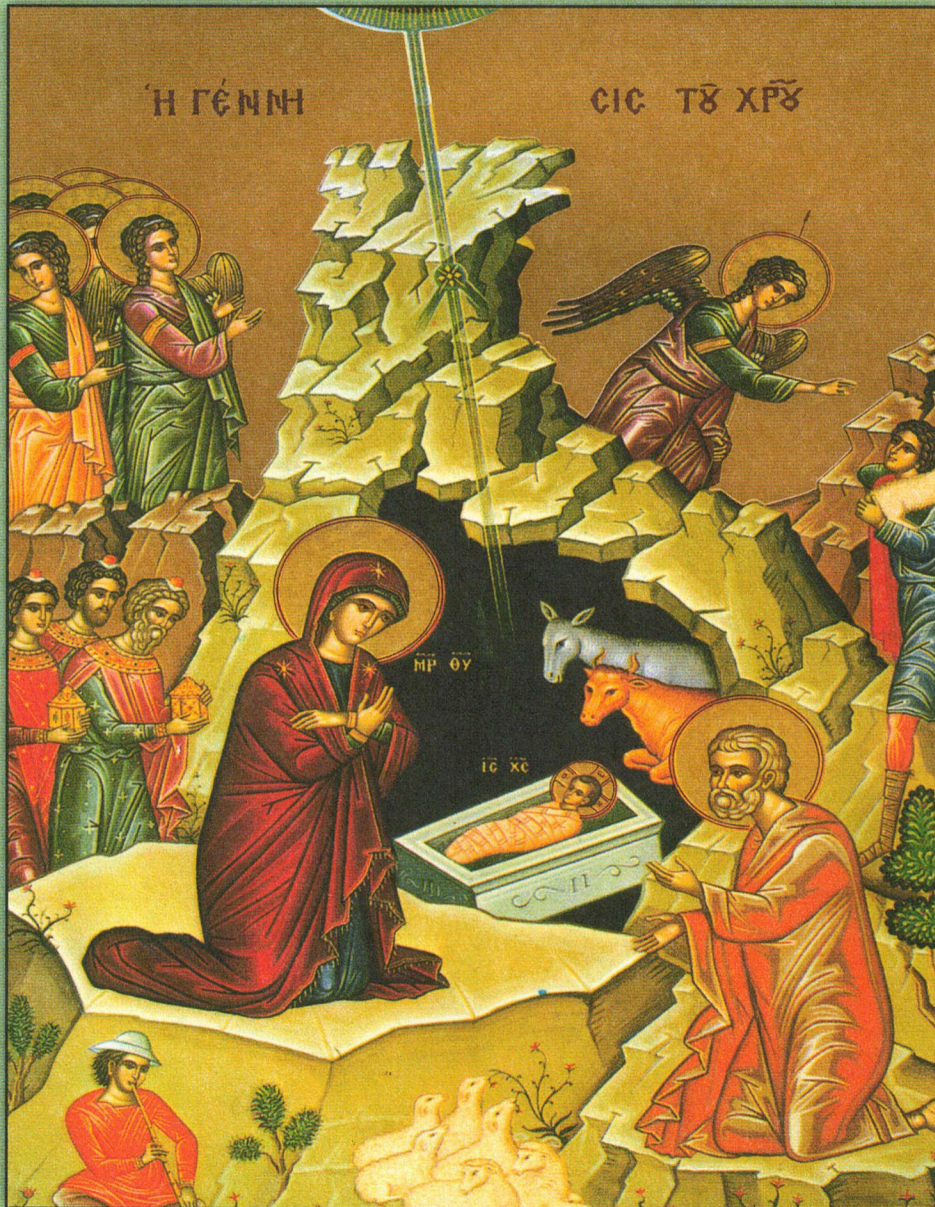
Icon of the Nativity of Our Lord