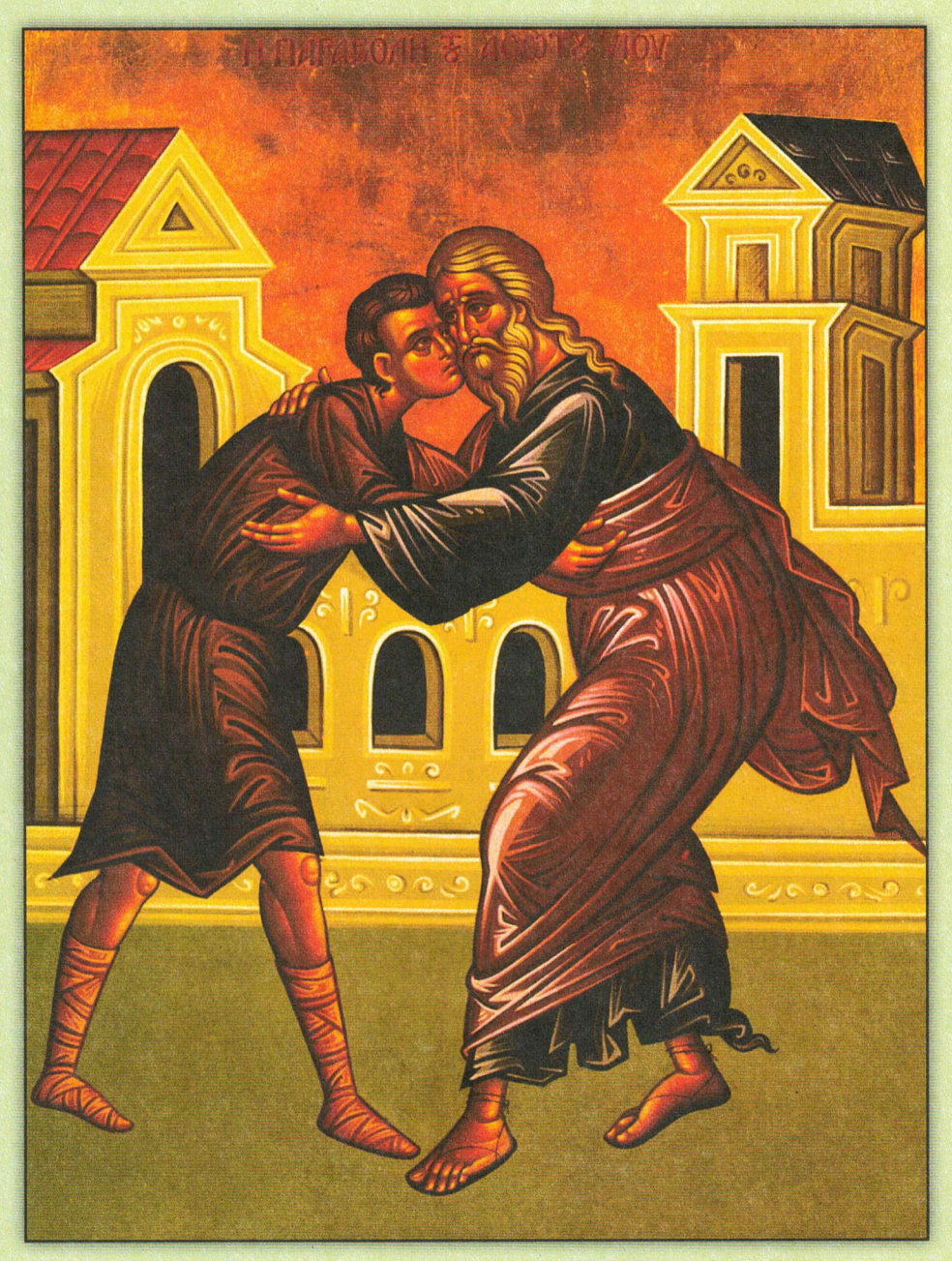
Icon of the Prodigal Son