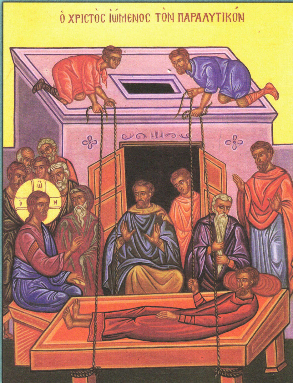
Icon of Healing the Paralytic