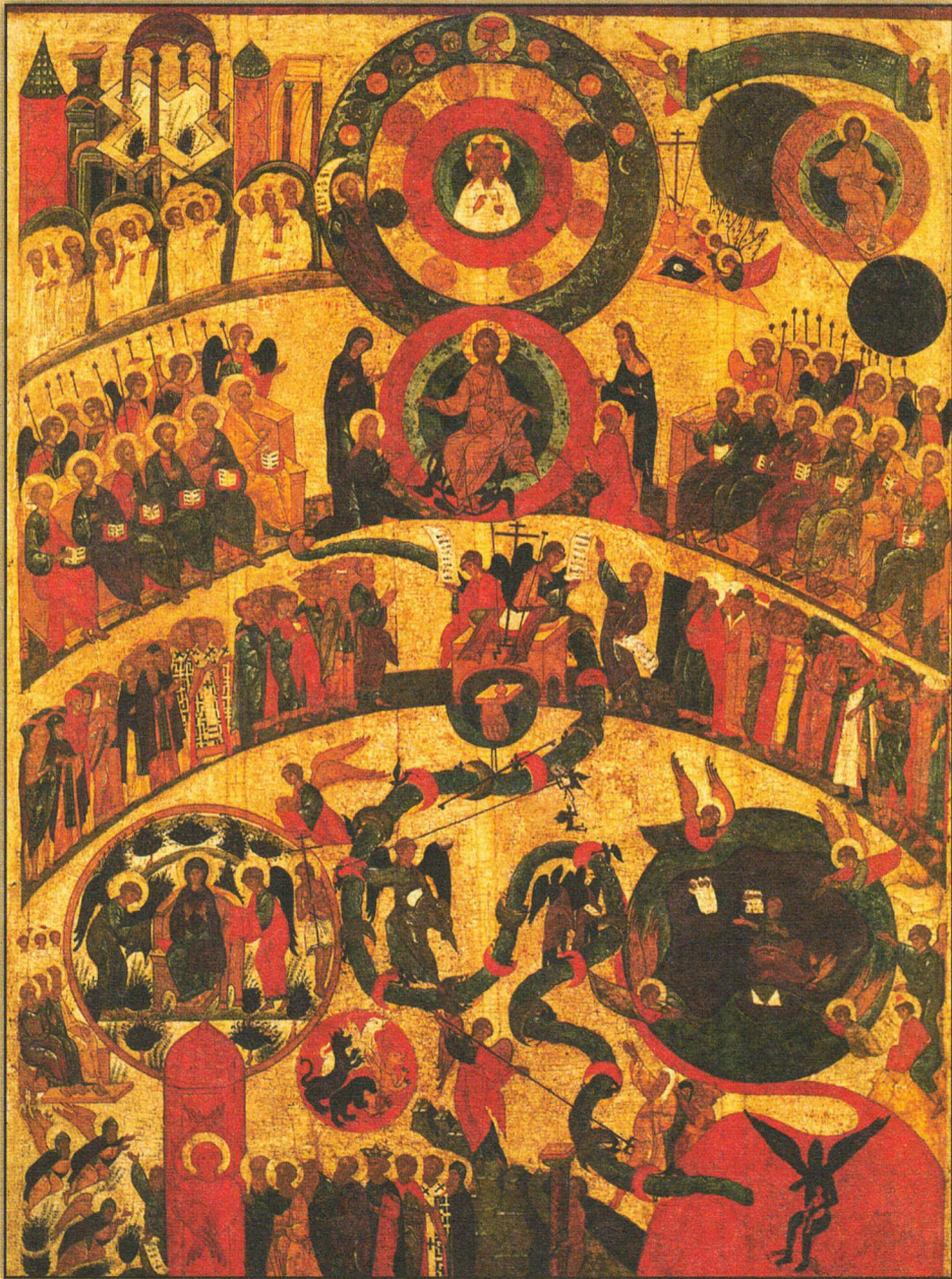
Icon of the Last Judgment