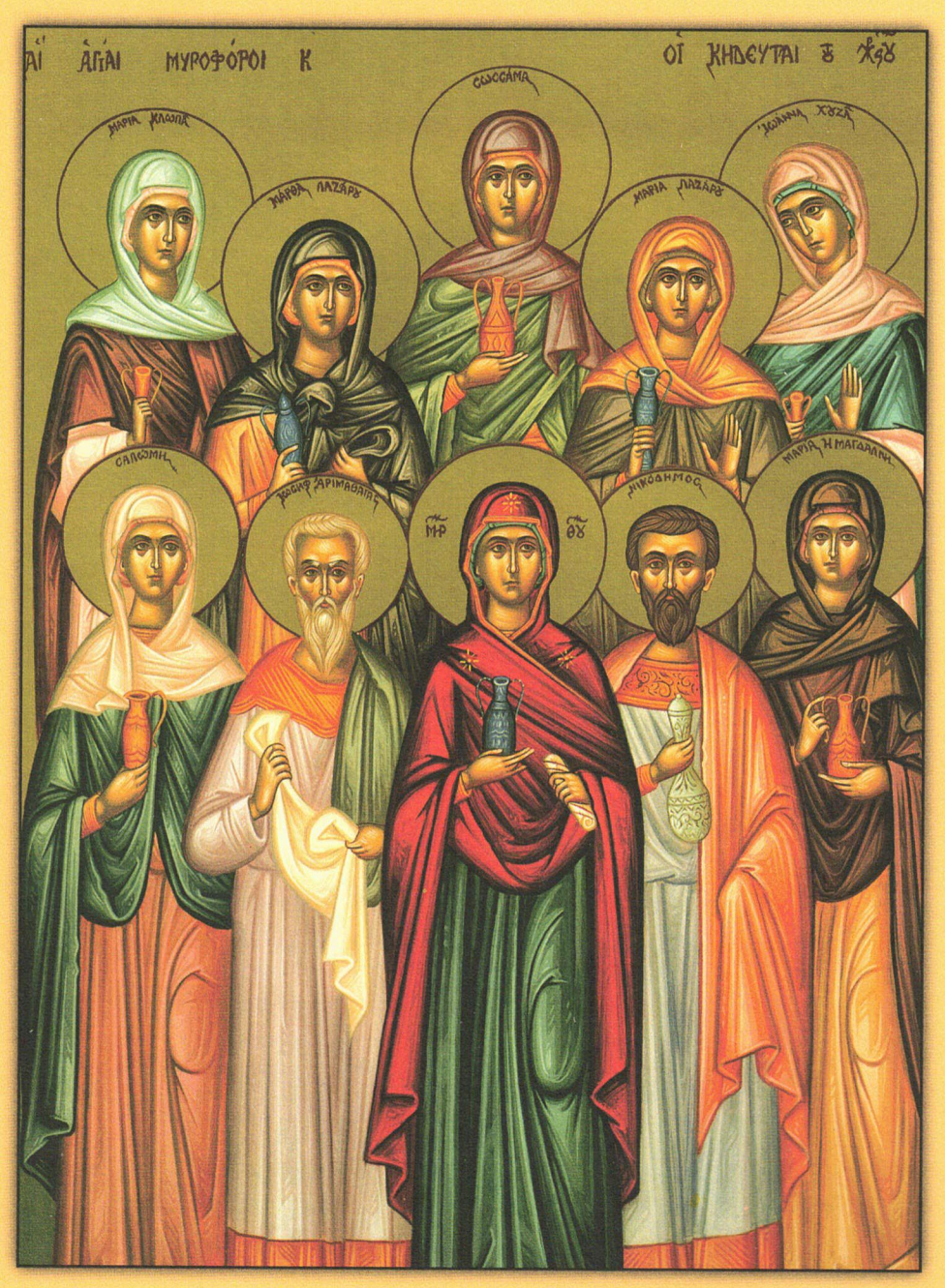
Icon of the Myrrh-bearing Women