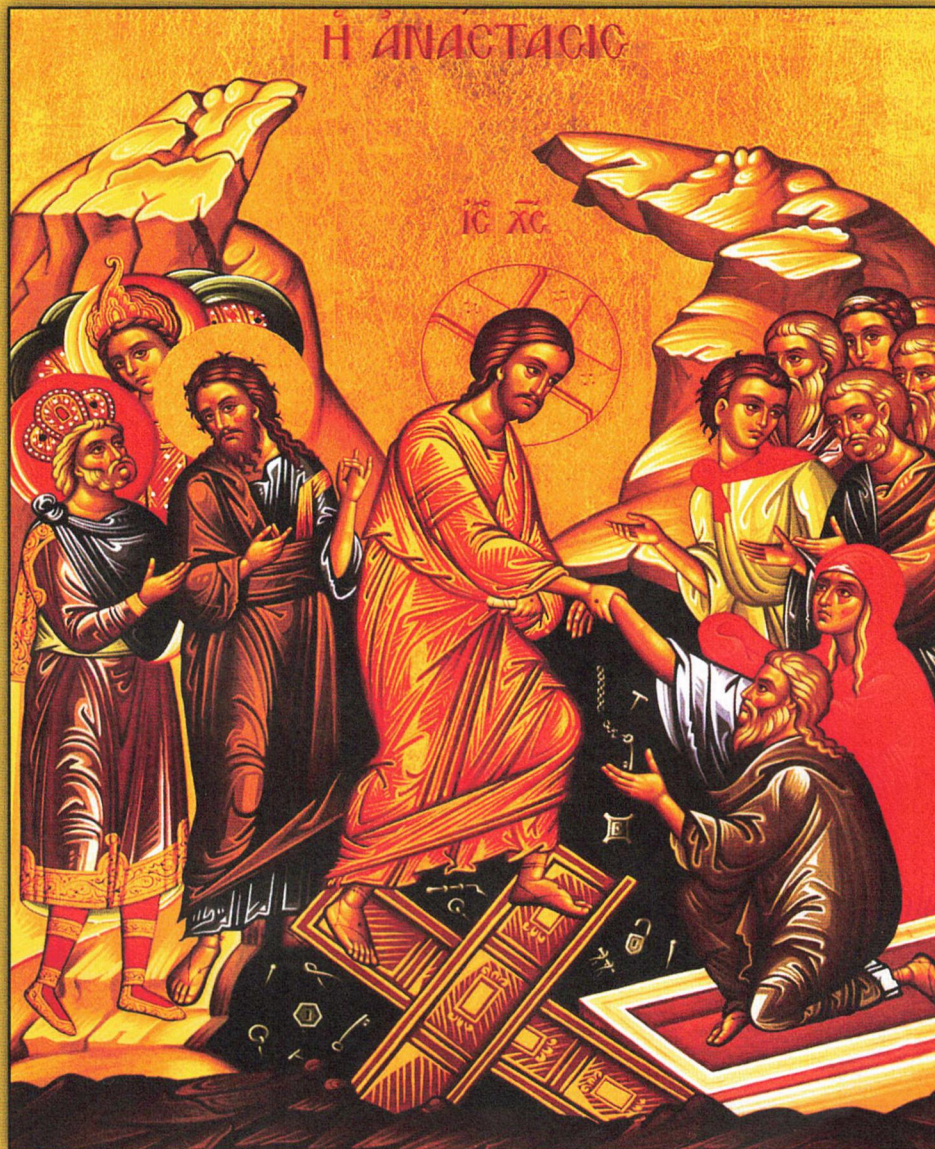
Icon of the Resurrection