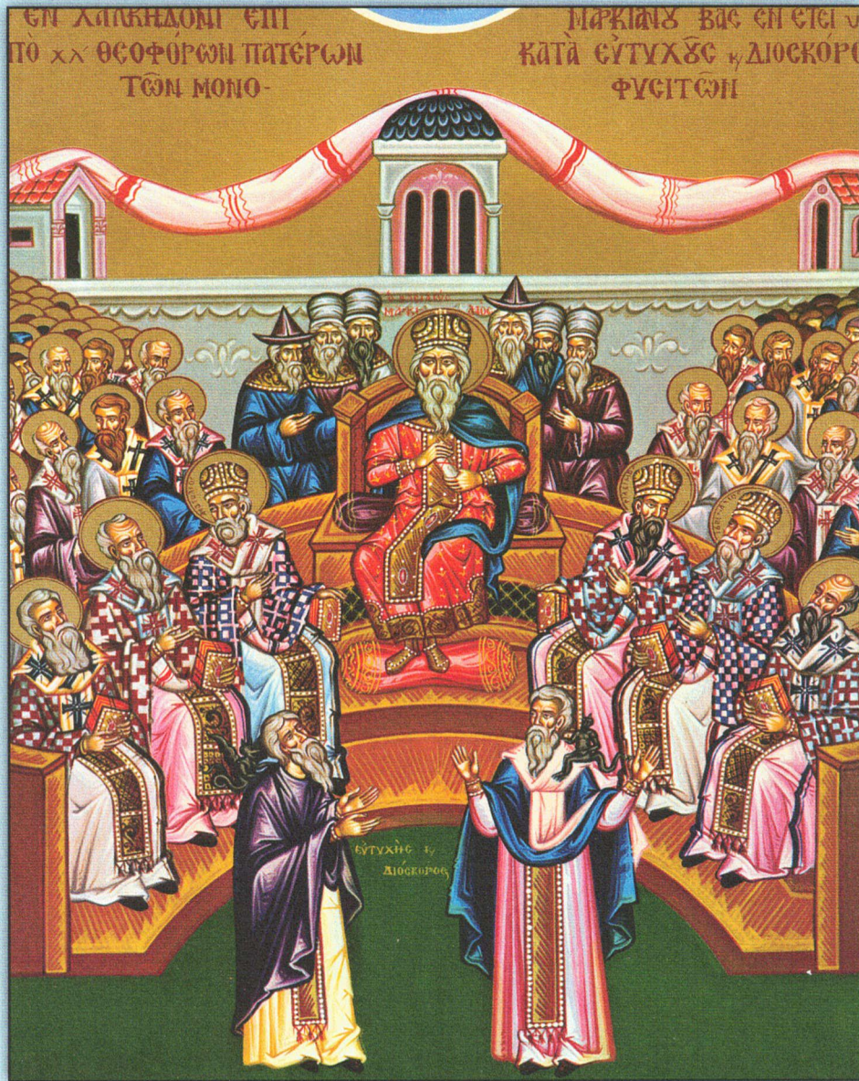
Icon of the First Six Ecumenical Councils