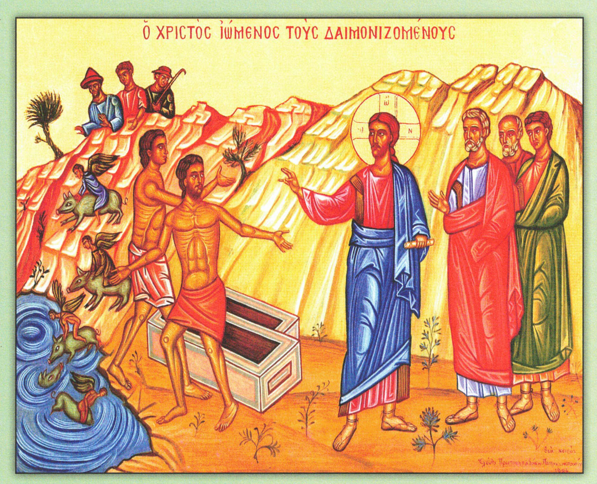
Icon of Christ Healing the Gadarenes