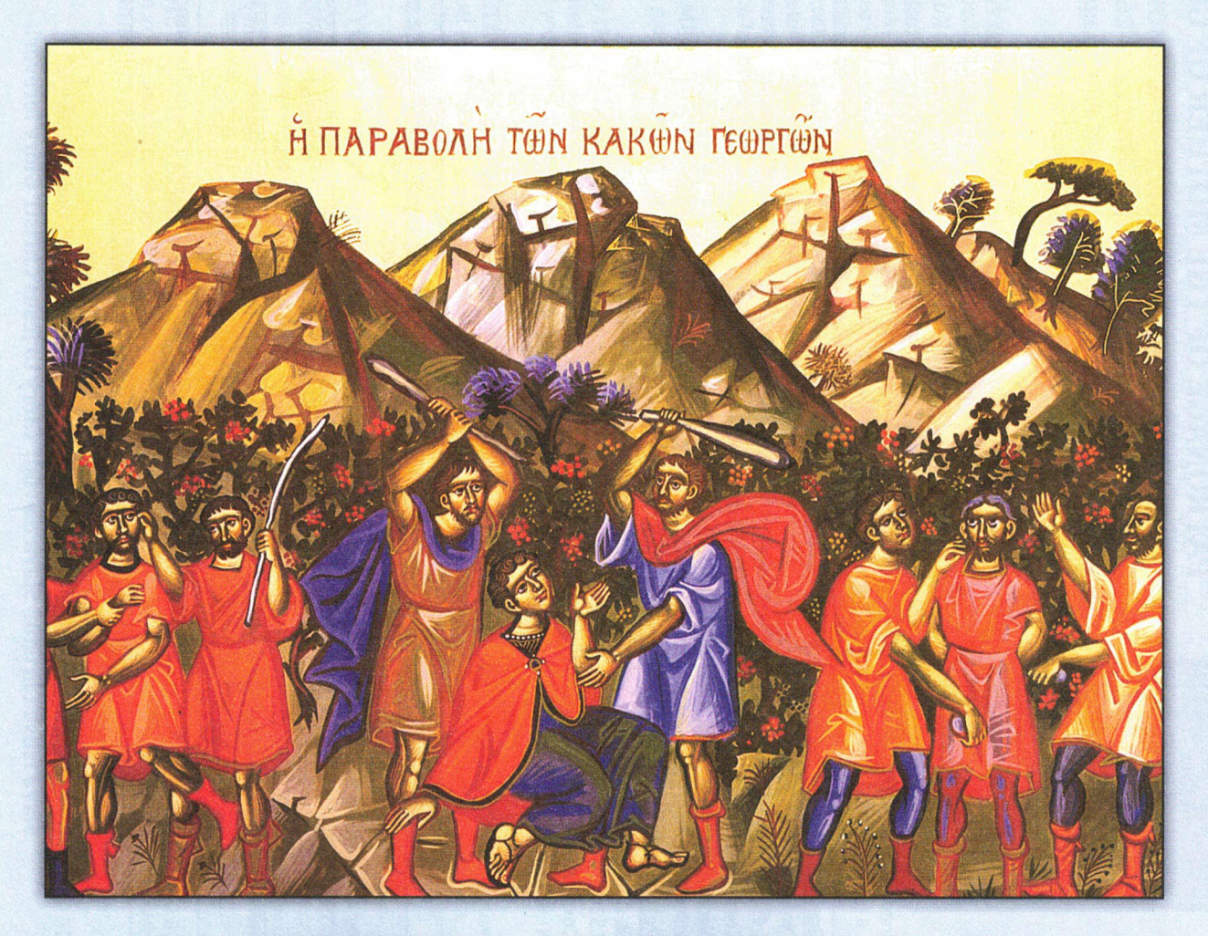
Icon of the Parable of the Evil Vineyard Workers (Matthew 21:33-43)