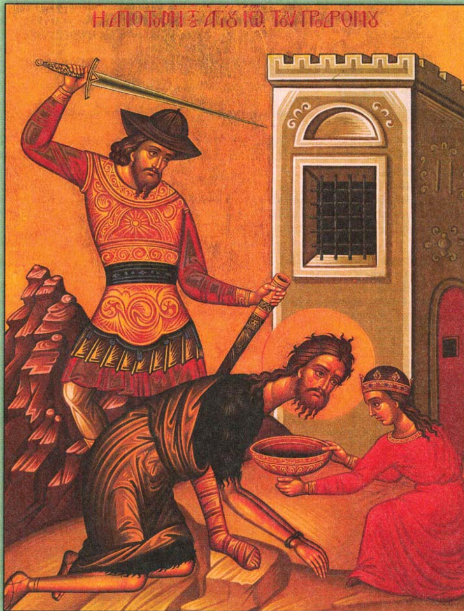
Icon of the Beheading of John the Baptist