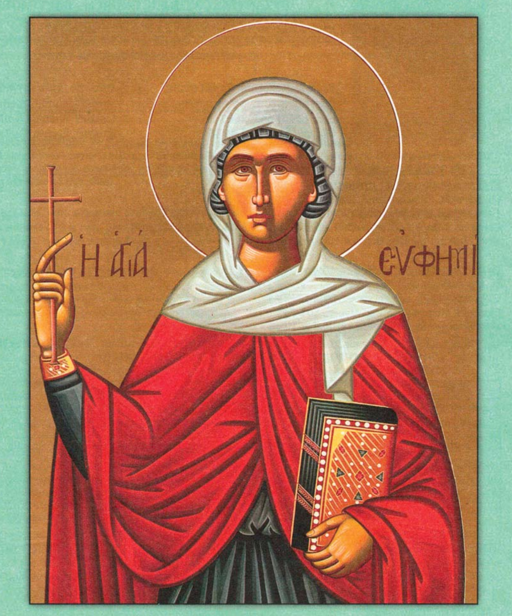
Icon of Saint Euphemia -- September 16th